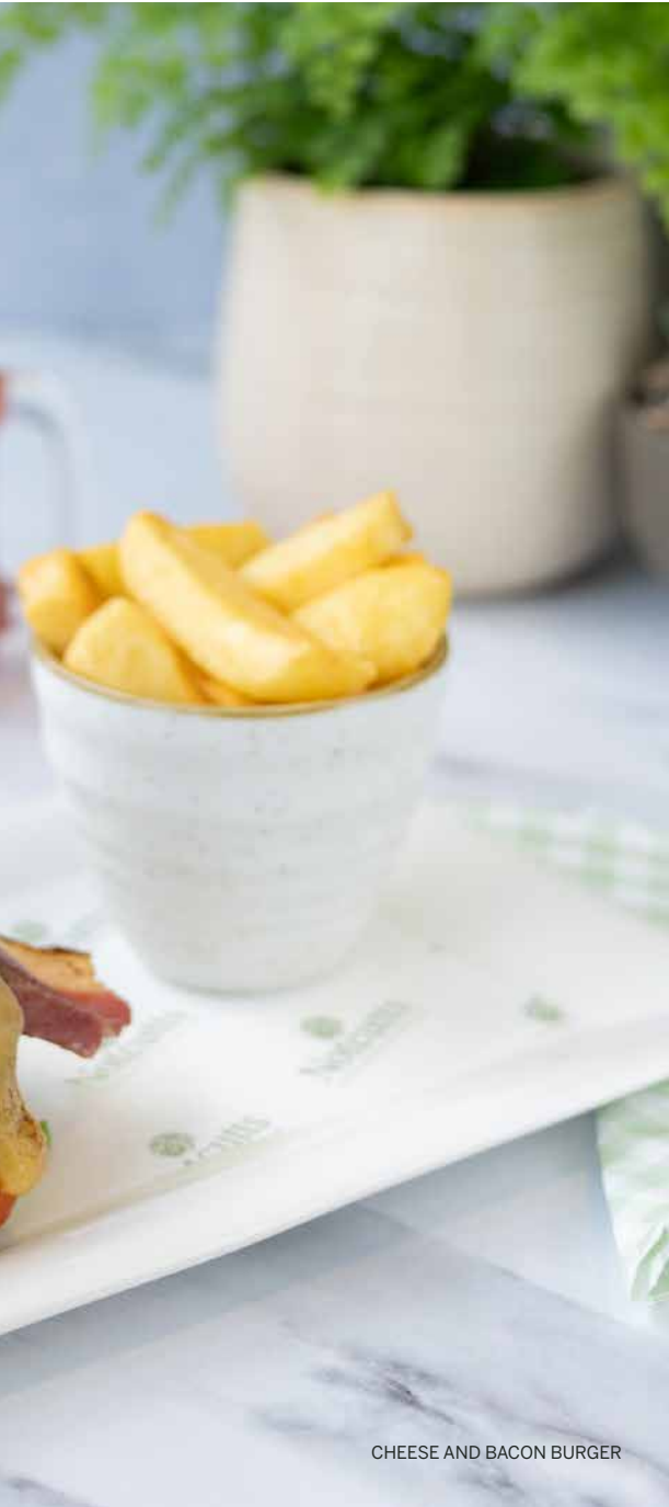
CHEESE AND BACON BURGER