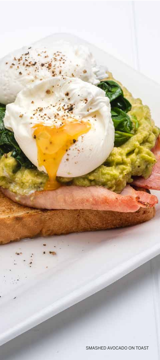
SMASHED AVOCADO ON TOAST